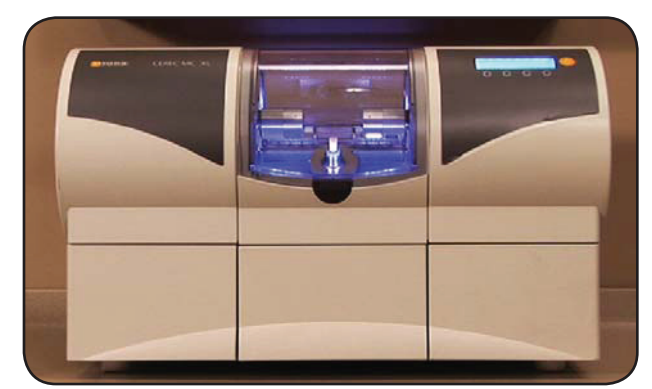
CAD/CAM milling machine