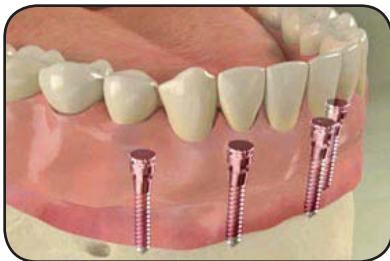
Mini implants for overdentures

Mini-implants are often used where there is not enough jawbone for conventional implants, or to temporarily stabilize a denture while conventional implants are healing.