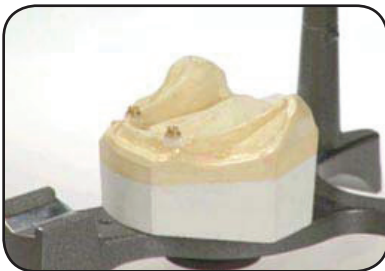
Implant posts on model

Although each case will be different, placing an implant-retained denture generally involves two phases. The first phase is the surgical placement of the implants. The second phase is fitting the dentures over the implants.