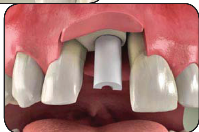
Implant abutment (extension for attaching a tooth)