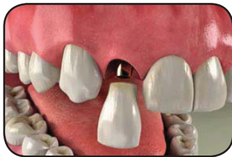
Single tooth implant