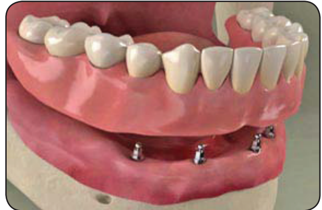
Full arch implant denture

With careful homecare and regular checkups and cleanings here in our office, an implant can be an excellent long-term solution for missing teeth.